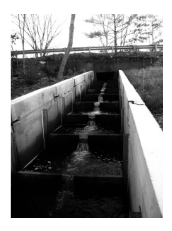
by: Chad Conway